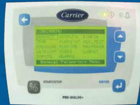
Pro-Dialog Plus Interface