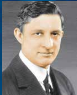
Dr. Willis Carrier

Carrier is a part of UTC Building & Industrial Systems, a unit of United Technologies Corp.(UTC), a leading provider to the aerospace and building systems industries worldwide. UTC was ranked at 151 st position in Fortune 500 list of global corporations in 2014.