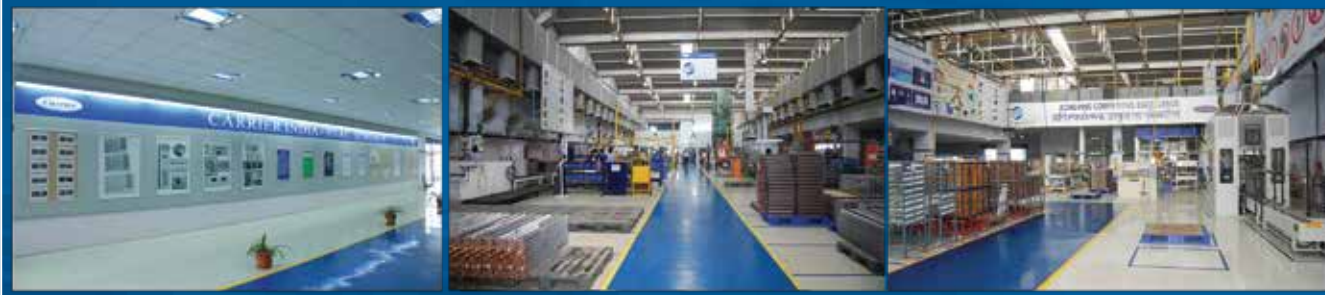
Snapshots of Carrier India, Gurgaon manufacturing facility

Our comprehensive Environment, Health & Safety (EH&S) program establishes a framework and provides tools for implementing our EH&S practices into our business & culture. The Carrier India, Gurgaon facility holds a distinctive record of delivering over 17 million man hours without a lost work day incident, clearly citing the measures of safety followed here.